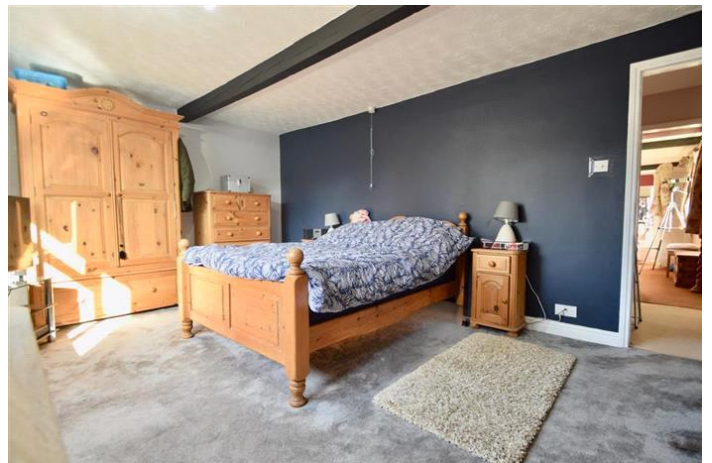
REDBERRY COTTAGE, STATION ROAD, WICKWAR, WOTTON-UNDER-EDGE £595,000 Freehold